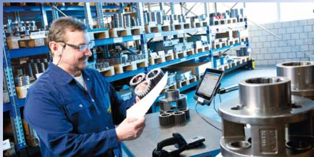
Standard parts are always available.