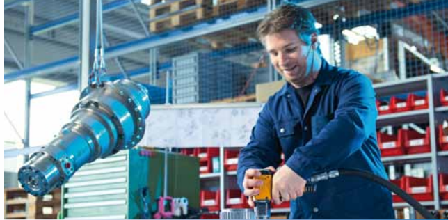
Gear unit assembly