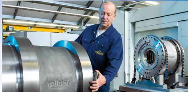
Boring and milling