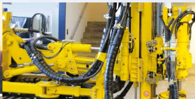
Earth drilling rig