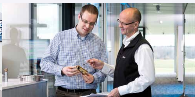
The basis of Rollstar - our motivated workforce.