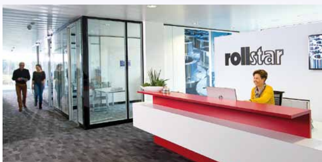
You are always welcome to visit Rollstar.

Together with efficient assembly, Rollstar offers an equally superior and speedy repair service: In two or three days we shall have dismantled your Rollstar unit and produced a quote. Standard repairs can be completed in just another two or three working days. If you need help in an emergency: spare parts can be delivered by Rollstar to any international airport within 72 hours.