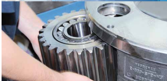
Planetary gear wheel assembly