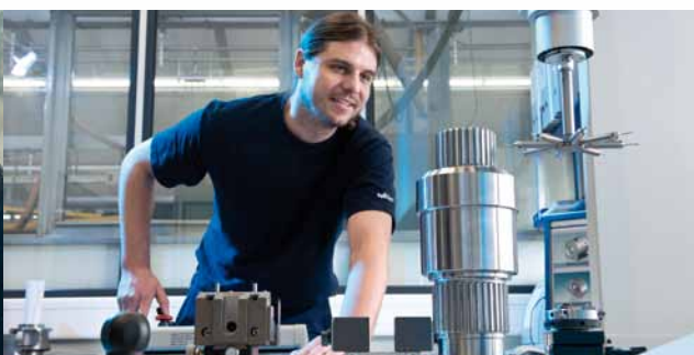
Air-conditioned measurement room