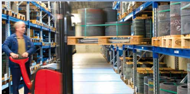
Our large stock of raw materials allows us to produce and deliver extremely rapidly.